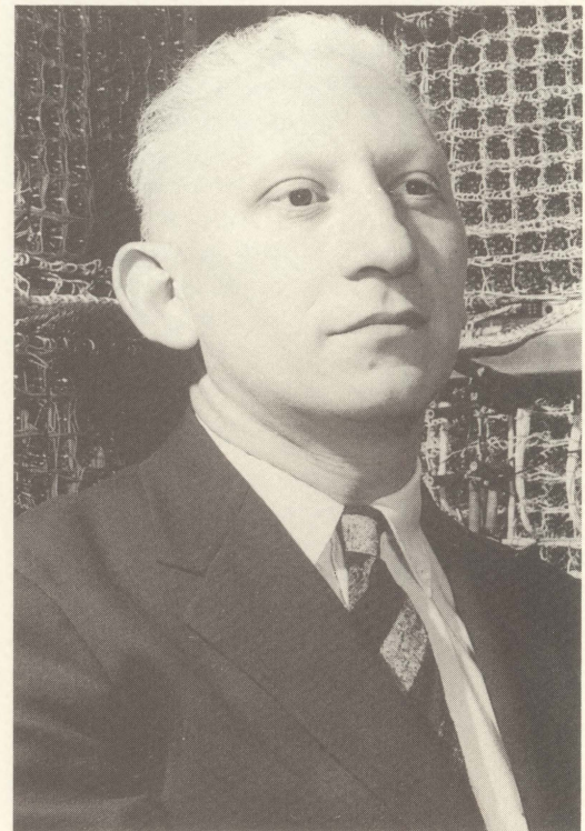
Dr. Alan J. Perlis