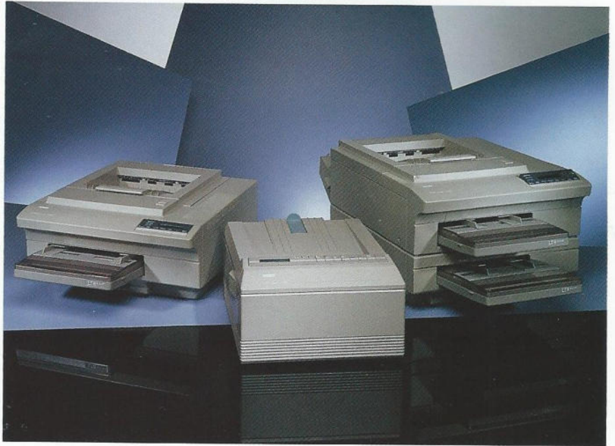
The DEClaser 1000 and 2000 Plus Series' optional lower paper cassettes can handle 250 sheets and 200 sheets respectively.