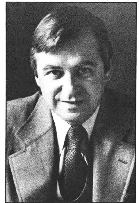
Sanders: "The Bi-Compliant head is definitely a Shugart design."