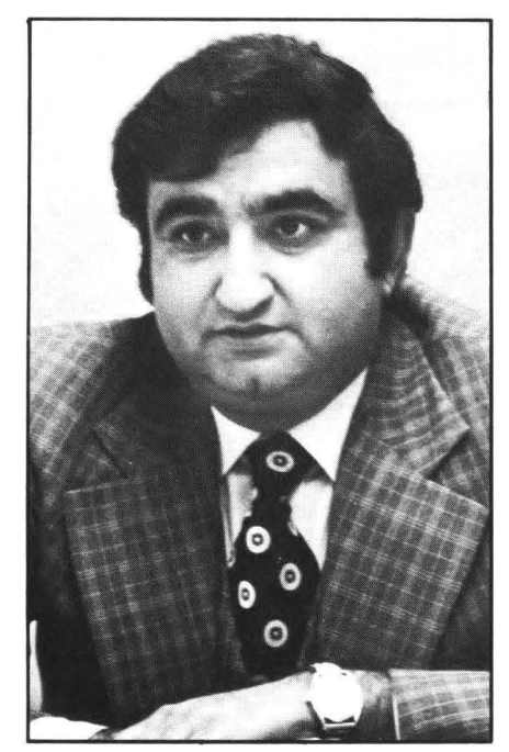
Tandon: "Shugart's head is a copy of our design."