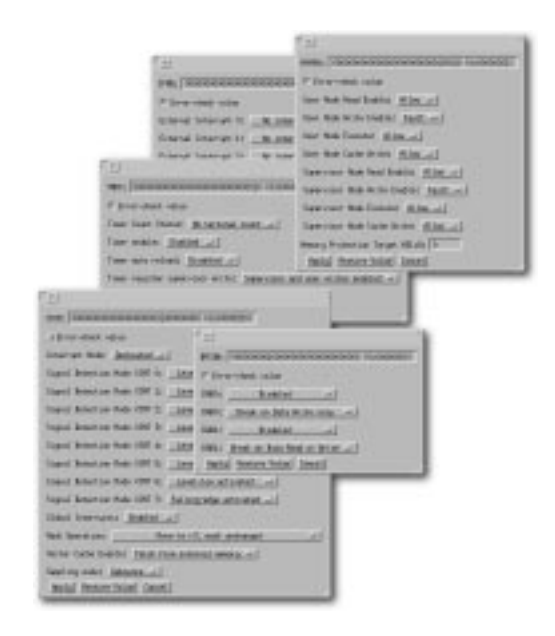
CPU Browser lets you keep the data books on the shelf.

To see how the new CodeTAP emulator can let you to do a lot more on your 960 RP project for a lot less, call 1-800-426-3925 today. And get an emulator you can call your own.