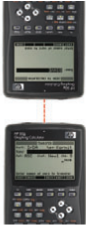
Communicate wirelessly through IrDA port

The HP 50g Graphing Calculator includes all the features of the HP 48gII plus: