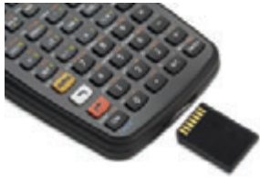
SD card slot for expanded memory and data transfer 4