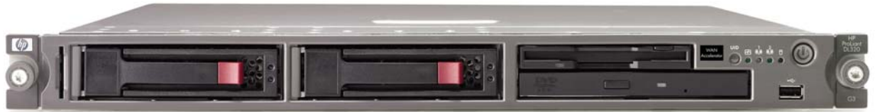
HP StorageWorks EFS DL320-510 WAN Accelerator