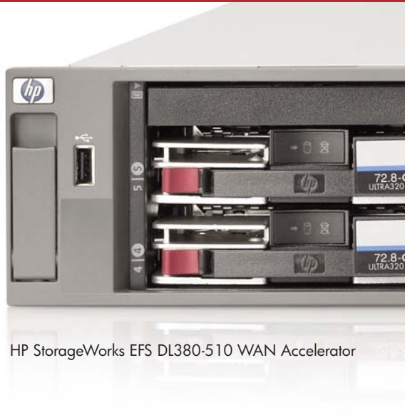
HP StorageWorks EFS DL380-510 WAN Accelerator

Increasing wide area network (WAN) performance and enterprise agility