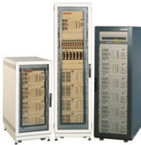
Rack Mounted Compaq Professional Workstations