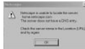
"Time Out" message in Netscape Navigator 4.0