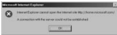
"Time Out" message in Internet Explorer 4.0

If you are running the Web Point Internet Distribution Center (Web Point) in the Automatic Dialing Mode (default mode), you may experience a "Time Out" message when you connect to your "Home" page. This event occurs because the browser may time out before Web Point finishes making the dial connection. The messages will look similar to the ones below. (Messages may vary with different browser versions.)