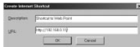
Netscape Navigator 4.0 Message Box