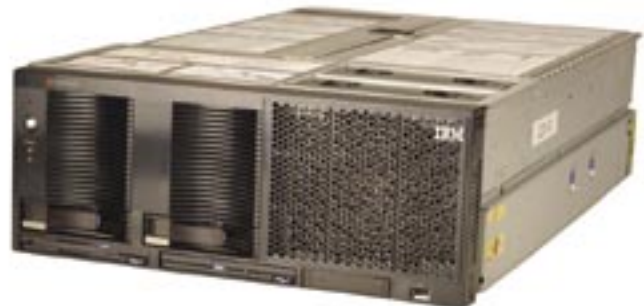
IBM @server x440

IBM Global Services offers a set of standard and optional services as part of the IBM Datacenter Solution Program. Services include factory hardware integration and installation of the operating system, a Solution Assurance Review 4 , 24x7 same-day hardware service with single point of contact and access to the joint IBM and Microsoft support queue. By providing hardware integration and operating system installation, IBM is able to fully test the operational readiness of the hardware configuration.